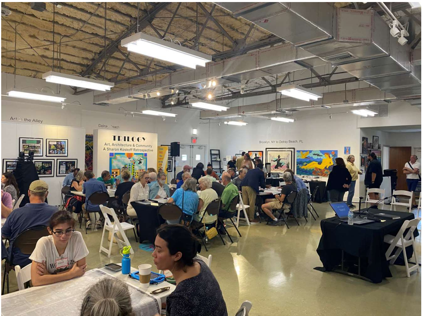
Members of the community working at tables with the design team during the Saturday, April, 30, 2022 Lake Worth Beach Downtown Charrette.

On Saturday, April 30, 2022, TCRPC conducted a public design workshop at the Hatch exhibition space at 1121 Lucerne Avenue. The workshop was the kick-off to a five-day public charrette which operated out of the same location. Over 60 members of the community participated that Saturday and provided their ideas on growth, development, scale, and the qualities that make Lake Worth Beach special. In addition to the Saturday attendance, nearly 20 people a day visited the charrette studio throughout the week providing additional input and dialogue. In all, it is estimated over 100 individuals participated in the process during the week of the charrette.