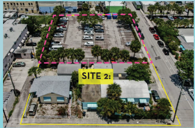
This is Site 2 from the original 2020 RFP – parcels located along K Street at 1st Avenue S

Location: City of Lake Worth Beach, City Commission Chambers, City Hall