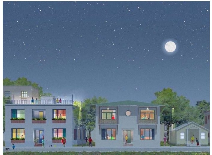
A charrette rendering illustrating potential incremental infill redevelopment.

On Wednesday, May 18, 2022, TCRPC will give a Work-In-Progress presentation at 6:00 pm in the City Commission Chambers. This will be the first opportunity for the team to present a comprehensive look at the work developed during the charrette. The Work-In-Progress presentation is an important opportunity to make sure the design concepts, reasoning and approach are consistent with the community's vision. It is also an opportunity to discuss the feasibility and rationale behind the recommendations. After gaining additional input from the May 18 th presentation, TCRPC will begin developing the draft report and recommendations. It is anticipated that the draft report will be delivered in August 2022 with specific recommendations for design, policy, and potential RFP strategies.