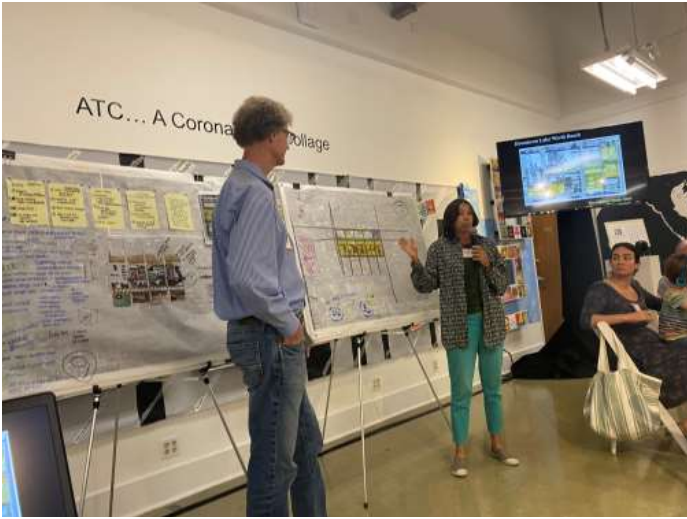
After working for hours, participants presented their ideas to the group.