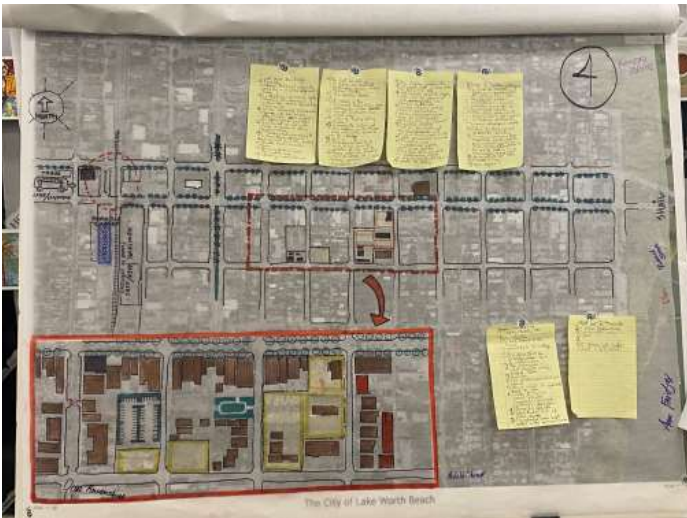
Above is one of the seven plans developed by the community.